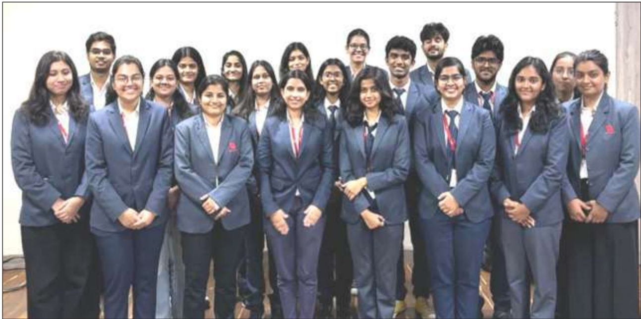
B.Sc. Placement Team 2024-25