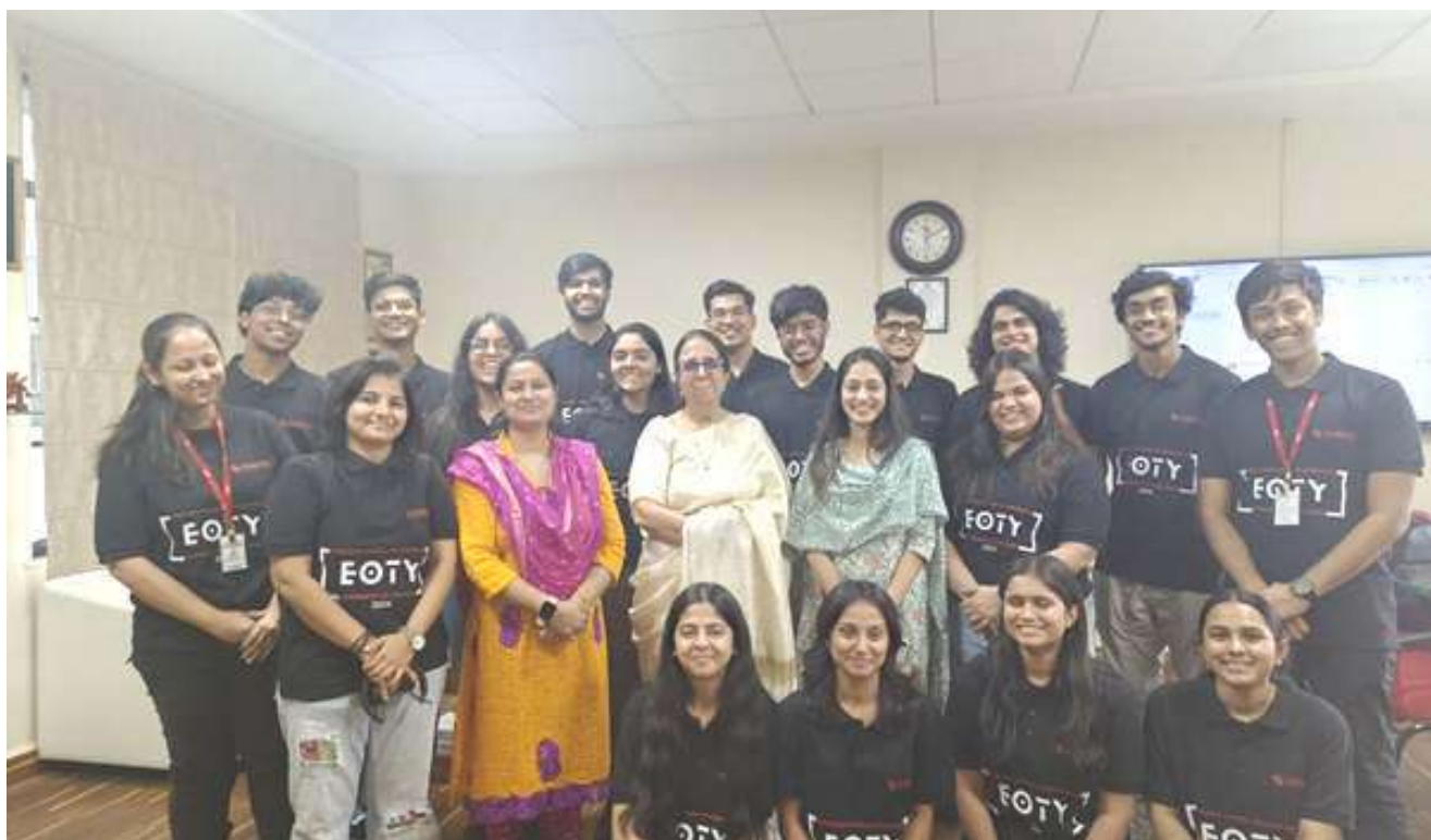
EOTY team 2023-24

SSE's yearly flagship event, Economist of the Year (EOTY), stands as a pinnacle of excellence where students nationwide exhibit their prowess in a diverse range of intellectually stimulating competitions. As the year progresses, the contest intensifies, challenging participants in various aspects, including analytical acumen, critical thinking, research aptitude, and a well-rounded grasp of general knowledge.